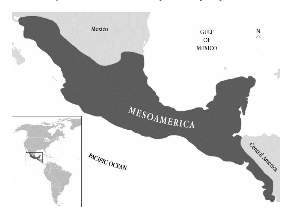
Map 1. The Mesoamerican area (adapted from http://mapsof.net)

Mesoamerica has been considered to be a linguistic area since the classic publication by Campbell et al. (1986) in which the authors identified several prominent linguistic features dispersed throughout the region from Northern Mexico to the mid-north of Central America, uniting dozens of genetically unrelated languages. These features include head-marking in nominal possession, the use of relational nouns instead of prepositions, vigesimal numeral systems, non-verb-final basic word order, and several widespread semantic calques; see also Smith-Stark (1994) and Brown (2011). All these features were shared due to language contact among speakers of different languages within that region long before the Conquest.