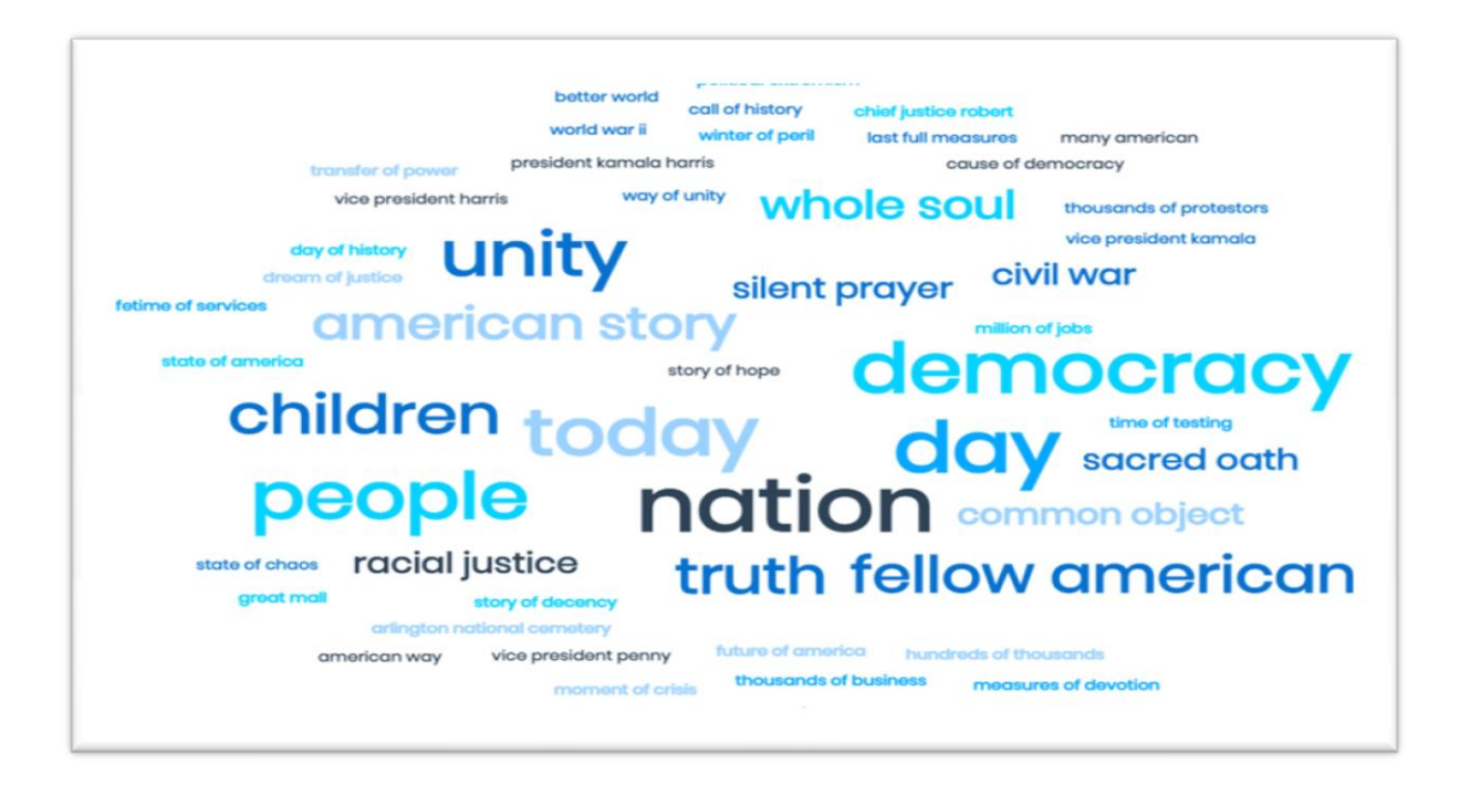
Figure 2. Word cloud of President Biden's inaugural speech

Examining the inaugural speech of Biden also shows that he established lexical cohesion through the use of repetition. Biden repeated words and phrases like 'democracy', 'nation', 'unity', 'people', 'children', 'racial justice', and 'American story'. He also repeated a long list of words as it is shown in the word cloud above. The repetitive usage of these words created lexical cohesion as the main theme of the speech was based on 'uniting' the 'nation' after the division of election, uplifting the belief in 'democracy' after the rioting in the capital, and securing a better tomorrow for the 'people' and the 'children' as the world faces a 'climate crisis'. The nature of the most commonly repeated words in Biden's speech reveals that he mainly focused on abstract concepts and American values (i.e., unity, democracy) concerning the public (i.e., children, people, the nation).