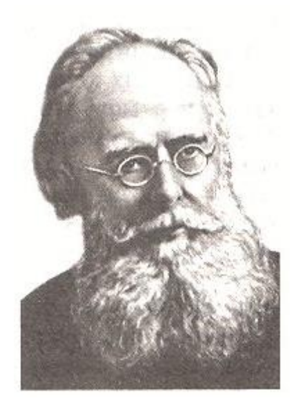
Figure 1. O. Potebnya

An outstanding representative of the psychological direction in Slavic linguistics is O. Potebnya (1985) – Ukrainian linguist, founder of the Kharkiv Linguistic School, a prominent figure in world linguistics. Potebnya (Figure 1) was significantly affected by the ideas of Humboldt, whom he considered a genius forerunner of the new language theory, in particular his theory of art and science as phenomena of human consciousness that develop in language.