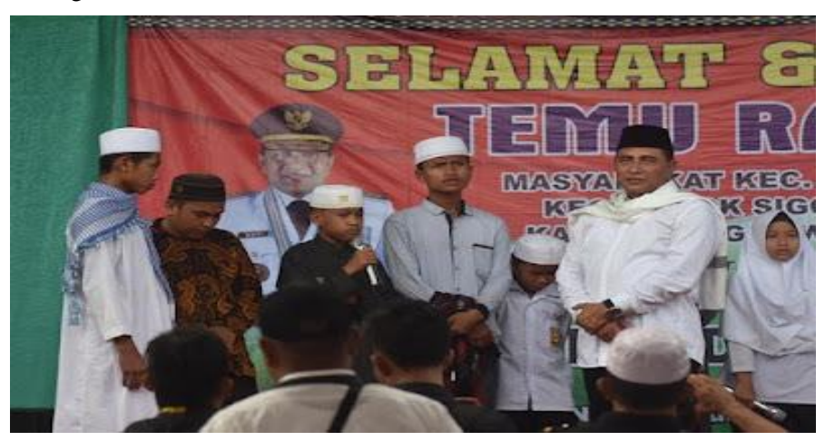
Figure 2. Appearance of Arabic Santri during the visit of the governor of North Sumatra

Darussalam Parmeraan Islamic Boarding School seeks to provide broad opportunities for students to practice the use of foreign languages in functional ways. One of the activities oriented to the development of language skills is speech training. This program gives students experience in learning integrated language skills. Because students use interrelated processes between reading, writing, speaking and listening skills.