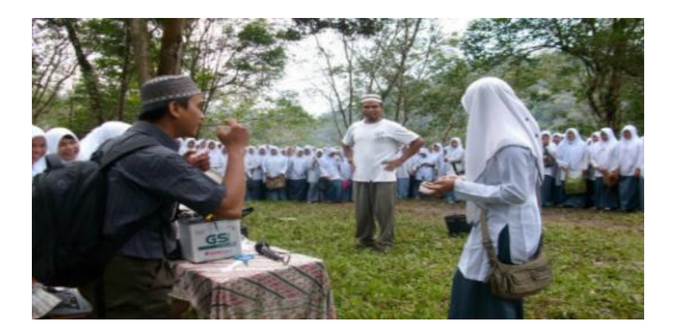
Figure 1. Activities in a Special Arabic Program

Takhashshush al-lughah al-'Arabiyyah at Darussalam Parmeraan Islamic boarding school is in the form of the formation of a group of students specializing in Arabic. The existence of groups like this has been found in many other institutions, and in general the existence of Arabic groups aims to explore languages for special purposes, such as Arabic for tourism, Arabic for hajj purposes, Arabic for Indonesian workers, journalism in the military (Nur, 2015) and others, while the special Arabic program at Darussalam Parmeraan Islamic boarding school is not intended specifically to explore li aghradh al-khash material but the main orientation is to realize students who are able to communicate with Arabic in various aspects of life.