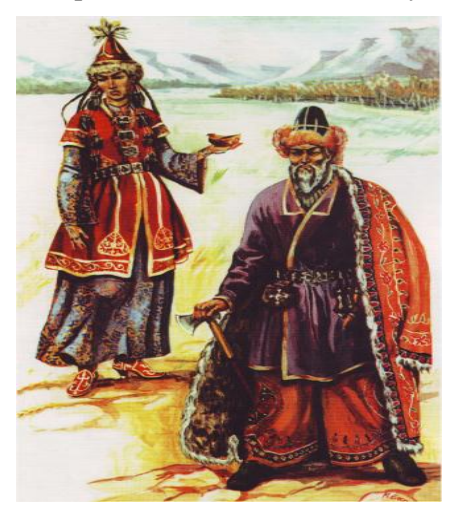
Figure 2. Kazakh people in their national clothes in XVIII century

The original ethnographic Kazakh costumes of the 19th century can also be noticed in the reconstruction picture based on archaeological materials by the artist M. V. Gorelik. A caftan, specific headdress, and painted shoes are examples of ancient version of Scythian clothing (Figure 2).