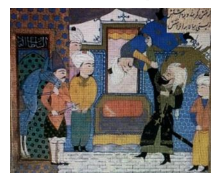
Figure. 5: Imam Ali's battle in the court of Tahmasp Shah

This color also has signs of spirituality and perfection. Green in the subtlety of spirit carries the message "Life is the tree of being" (Simnani, 1990). The manifestation of this light at the end of the subtlety of truth means total annihilation and resurrection of the soul. After that, the seeker stays in paradise and pays full attention to the Great Truth (God) until the essence of truth is manifested on the mystic (ibid.). Green is a combination of the two main colors; blue and yellow, needless of warm or cool properties; The green light of subtlety of truth, as the level of perfection of the seeker, is the only additive color in Simnani's opinions. This color is a combination of the color of the Nafs and the color of the soul; In this position, the mystic will always see the green light on his path which is a sign of obedience (Taheri and Varedi, 2018). Green means stability, willpower, consistency, self-awareness and pride (Luscher, 2002). The black color previously discussed is the subtle light referred to as the manifestation of the