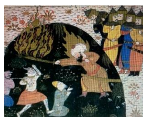
Figure 2. Battle of Imam Ali (AS) with mythical creatures

The light of the human soul has not risen and the very soul-pleasing yellow color does not appear until the Nafs (Lust) is not subdued and the heart is not strong enough against it. The color of the light of the soul is described with the adjective "extremely pleasant" and the most important effect and psychological message of this color is to create strength and courage in the seeker. "Seeing it makes the Nafs weak and the heart strong." The profound effect of yellow on the heart indicates the fact in mystical chromatography that yellow belongs to the "heart". In a fire, the yellow color is the ray of the heart (Simnani, 1983, 265). Physiologically, yellow means relief from responsibilities, problems, harassment or restrictions "(Luscher, 2002).