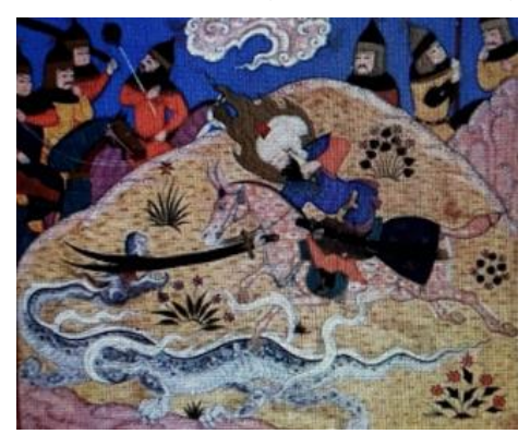
Figure 1. Battle of Imam Ali with the dragon, Source: (Khosfi Birjandi, 2002, 123)

It shows Imam Ali's battle with the dragon. The army of enemy is facing the army of Islam behind a hill. Imam Ali (AS) is seen in this painting with a white turban and a blue and red clothing.