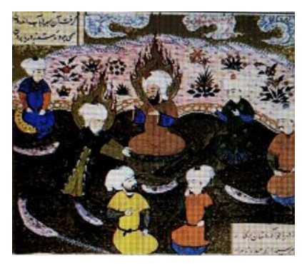
Figure 4. Al-Khidr coming to meet Imam Ali, Source: Khosfi Birjandi, 2002, 103)

In this painting, Imam Ali is depicted with a khaki and blue clothing, and Khidr can be seen with the green color of his innerwear (undergarment) and his black cloak; the same clothing of Muhammad (PBUH), which was discussed in the painting of "The Miracle of Muhammad".