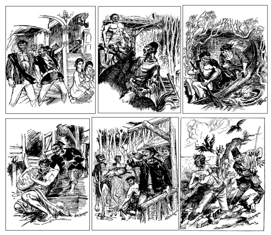
© 1963 DELSY SJAMSUMAR / BP ARYAGUNA

When the sub-title mentioned The Legend of South Lampung, the novel BuangTonjamis clearly about identity politics. As the codes put down in the written text can't described everything, the illustration substituted what is going to be the lack of the written text. In this case, the remediation of the novel by the illustration, is the act of hypermediary strategy, where the medium take attention to the media itself—which is not always the remediation of the written text, but sometime like an independent narrative, still with BuangTonjamas the theme.