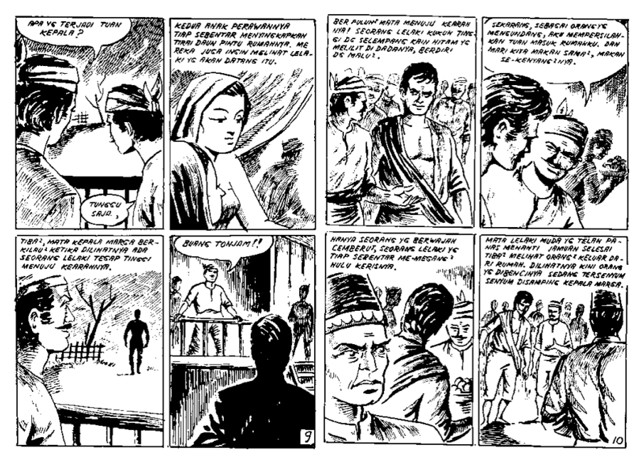
© 1978 U.SYAHBUDIN / KARYA BHAKTI