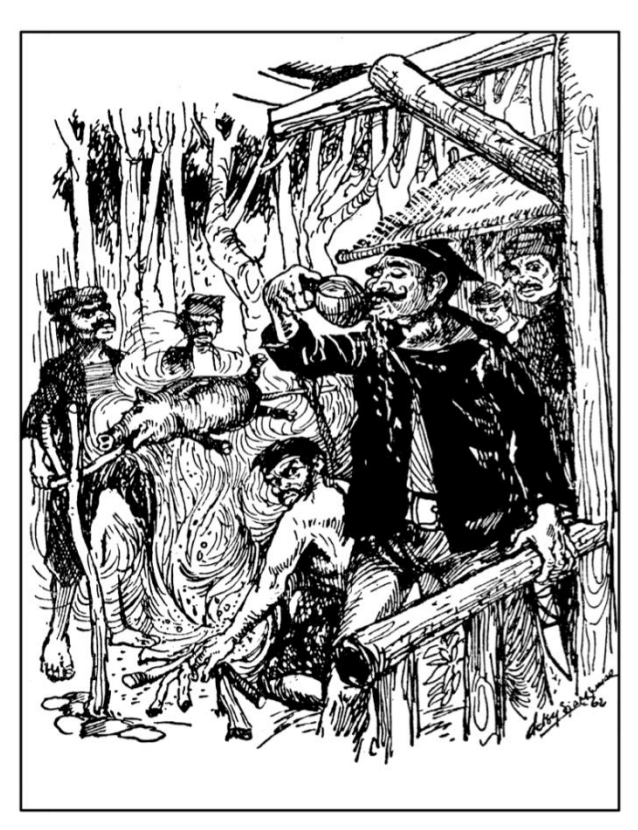
© 1963 DELSY SJAMSUMAR / BP ARYAGUNA

... every gulp of the nirawater that slurped by Sugriwa from the jar's nozzle, made that whiz's eyes flare up so reddish like the fire in the hearth (p. 69-71).