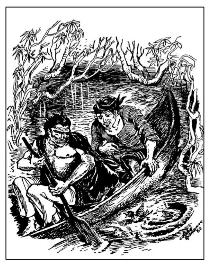
© 1963 DELSY SJAMSUMAR / BP ARYAGUNA

The wind on the river speed up their boat to downstream. A red head river-bird dived into the water then fly to the sky (p. 39).