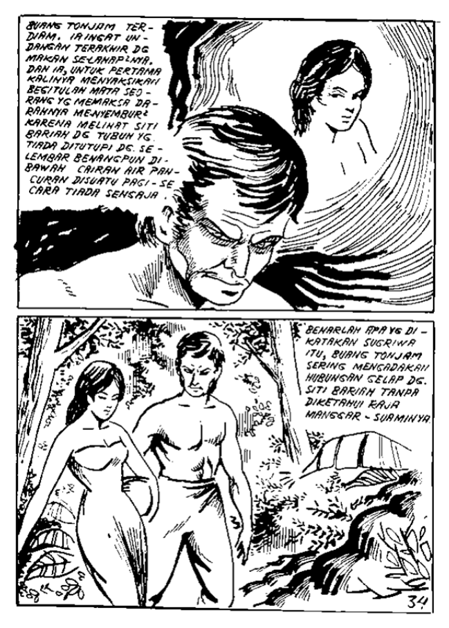
© 1978 U.SYAHBUDIN / KARYA BHAKTI

So, in this upper-panel the reader could find the same sentence in the novel, with only some few adjustments, because it is shortened exactly in the process like this: