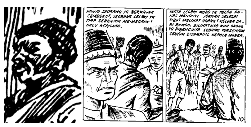
© 1963 DELSY SJAMSUMAR / BP ARYAGUNA © 1978 U.SYAHBUDIN / KARYA BHAKTI

The tendency for hypermediacy on the illustration, as the drawing seems try to attract the readers more; and the tendency for immediacy on the picture-story, as the drawing seems like not to attract anything to the medium itself while the readers continue following the story. It doesn't mean the strategy of immediacy gives a neutral site without connotation, on the contrary the no-gaze faces and the veils of the two women which the eyes directed downward is like an irony of pretenders if connected to the narration, that they really want to see Buang. In this scene showed as the act of what should be looked. The immediacy strategy is a strategy of disguise.