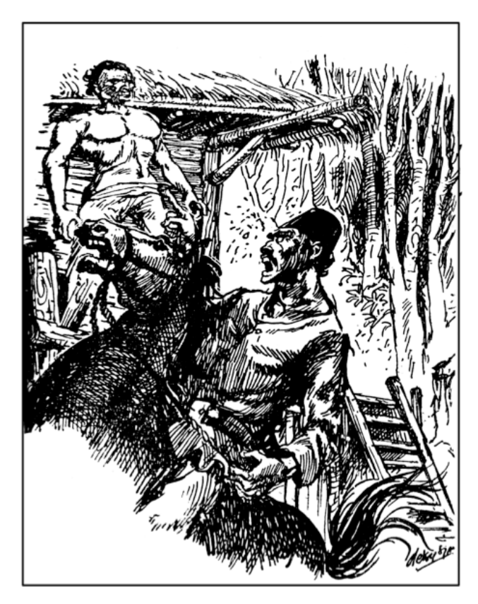
© 1978 DELSY SJAMSUMAR / BP ARYAGUNA

The chief's bloodalready boiled, (but he) patiently try to handle himself to be cool.