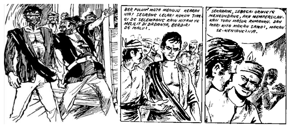
© 1963 DELSY SJAMSUMAR / BP ARYAGUNA © 1978 U.SYAHBUDIN / KARYA BHAKTI