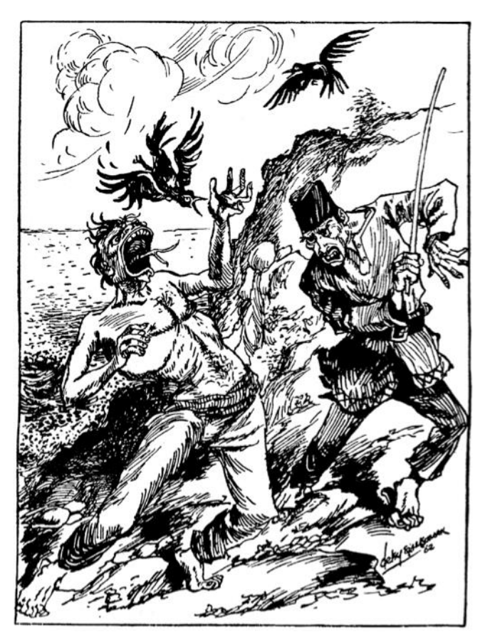
© 1963 DELSY SJAMSUMAR / BP ARYAGUNA

This one bird dive and dive again! The feel of infuriated in Buang emerge. He opened his mouth. It appeared that Buang's mouth so wide as wide-mouthed clay pot—and, and, in a second, he already swallowed that one crow bird! (p. 95).