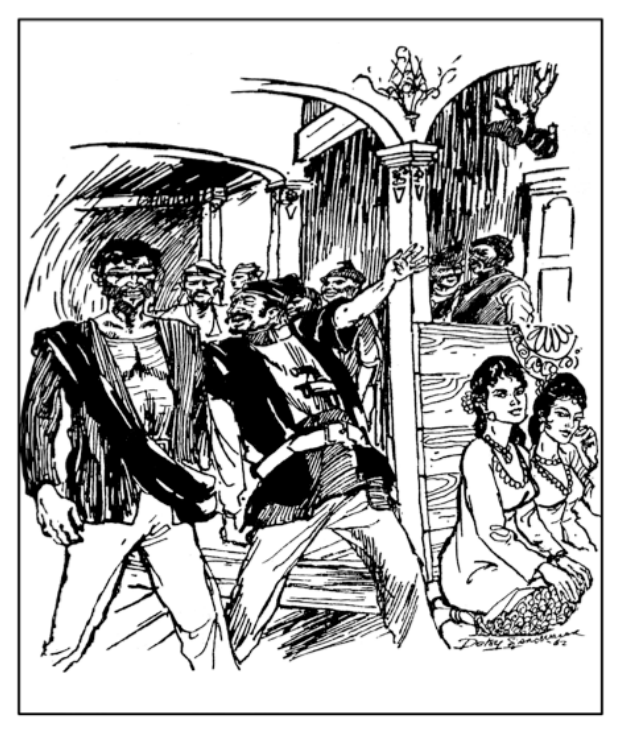
© 1963 DELSY SJAMSUMAR / BP ARYAGUNA

The Reception for BuangTonjam in Four Materials: Illustration with the written text as the source that match.