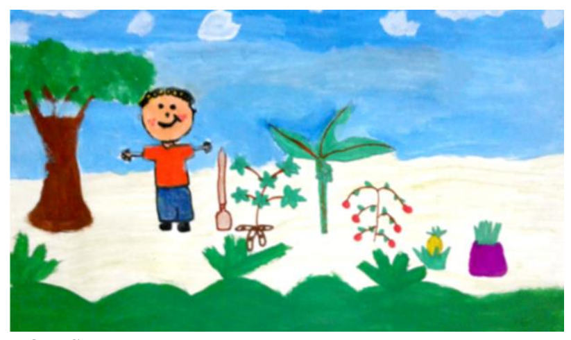
Figure 4. Drawing Pilar 6, municipality of Tibú, teenager 14 years old

The drawing presented below is the representation of the prosperous countryside dreamed of by the children and youth of Catatumbo, in which the farmer is related to the ecological factors of the context represented in the drawing such as grass, trees, fruits, soil, crops, reflecting expressions of hope, patience and longing, also the vision of peaceful countryside, with the right to cultivate, to healthy food and a farmer with guarantees.