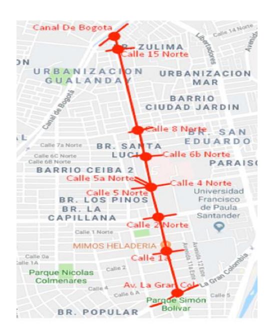
Figure 1. Study area and critical points

Speed sampling at intersections is obtained by the floating vehicle method, by having the vehicle circulate at a speed that represents average traffic conditions, allowing the vehicle to "float" among the others. A gauging device is needed to record the times of passage through checkpoints or intersections, taking distances traveled from the beginning of the section, speeds indicated by the vehicle's speedometer, measuring the time taken for each delay experienced by the vehicle and associating each delay to the exact place where it was experienced.