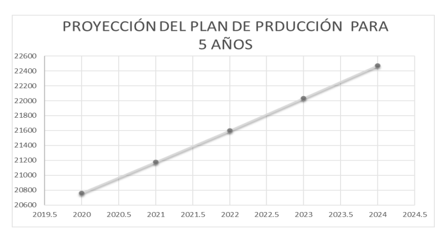
Figure 2. Projected production plan

For the year 2020, monthly orders of 1730 units will be placed, the year will be 20760 units, for the analysis of the following year, 2% will be added to the previous year and so on.